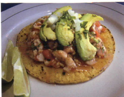
Shrimp Taco: $3.49 + tax